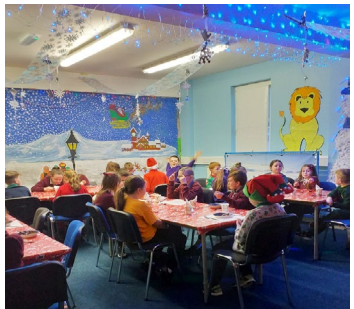
Children enjoying the Annual Christmas Dinner at the Out of School Hours Club in West Belfast.

They took great memories of 2019 with them into 2020 and are already planning for the Summer Scheme.