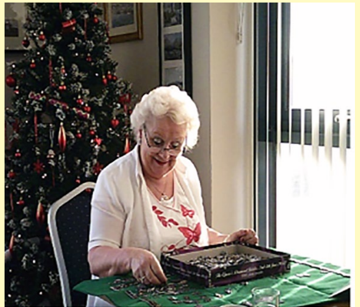
Guests enjoying a Clare Lodge Christmas