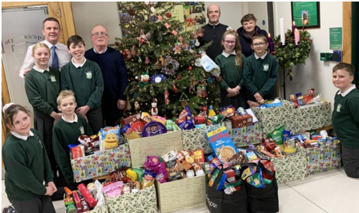
St Patrick's Primary School, presenting hampers to members of their local SVP Conference.