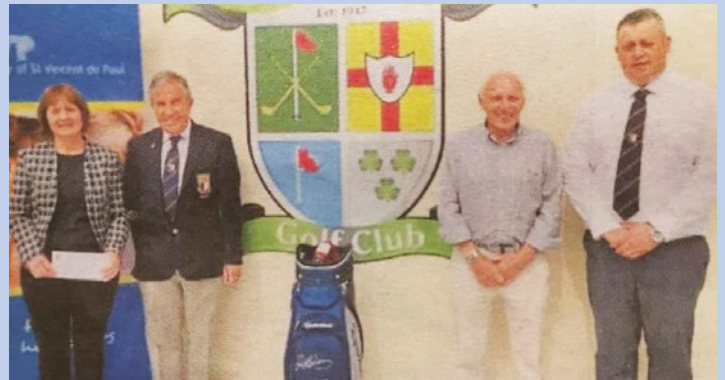
Portrush Conference received a donation of £1,000 donated from Rathmore Golf Club during The Open.